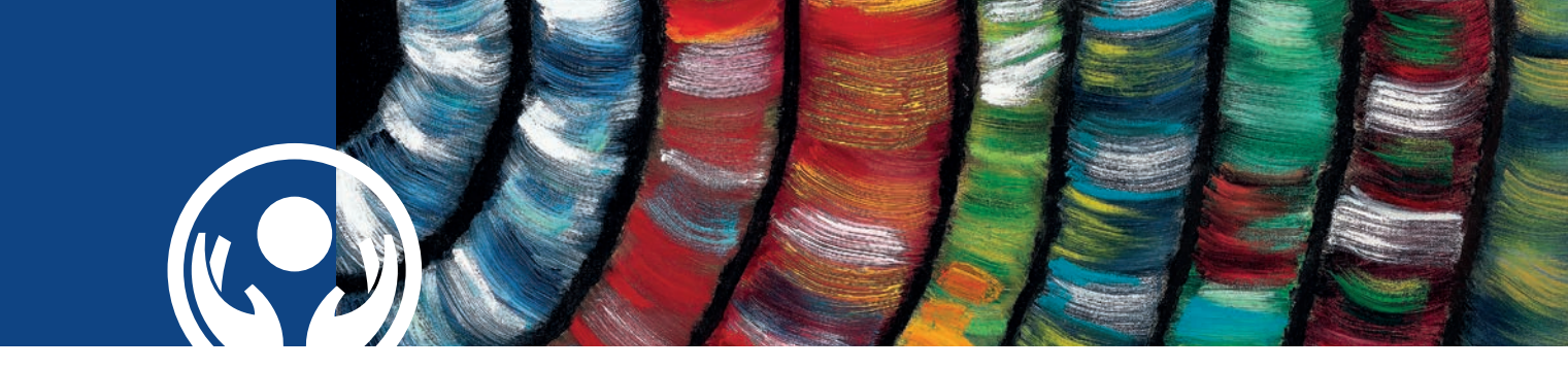
Action: Recognise and respect First Peoples' cultural heritage.