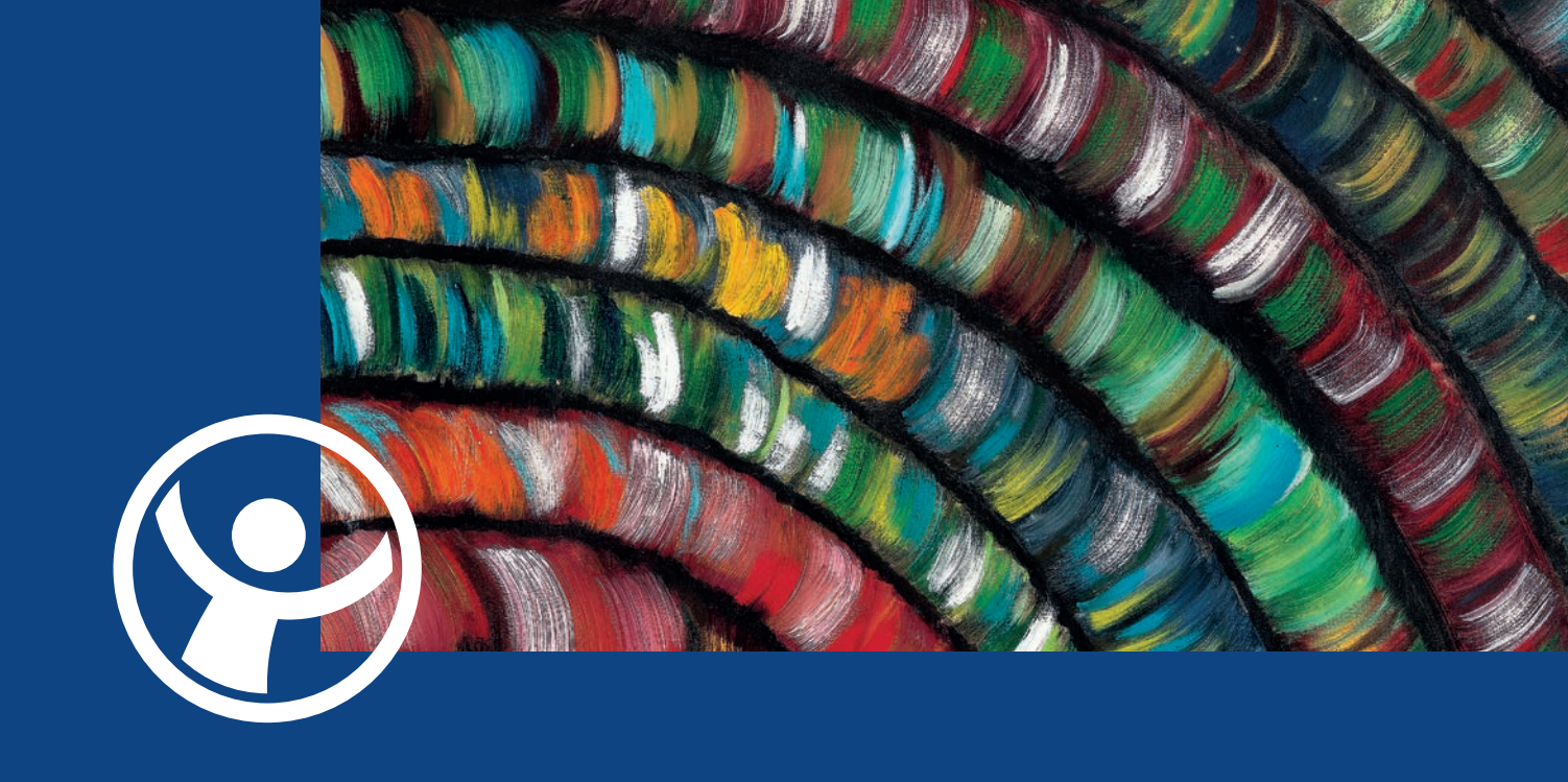
Action: Increase supplier diversity to support improved economic and social outcomes for First Peoples.