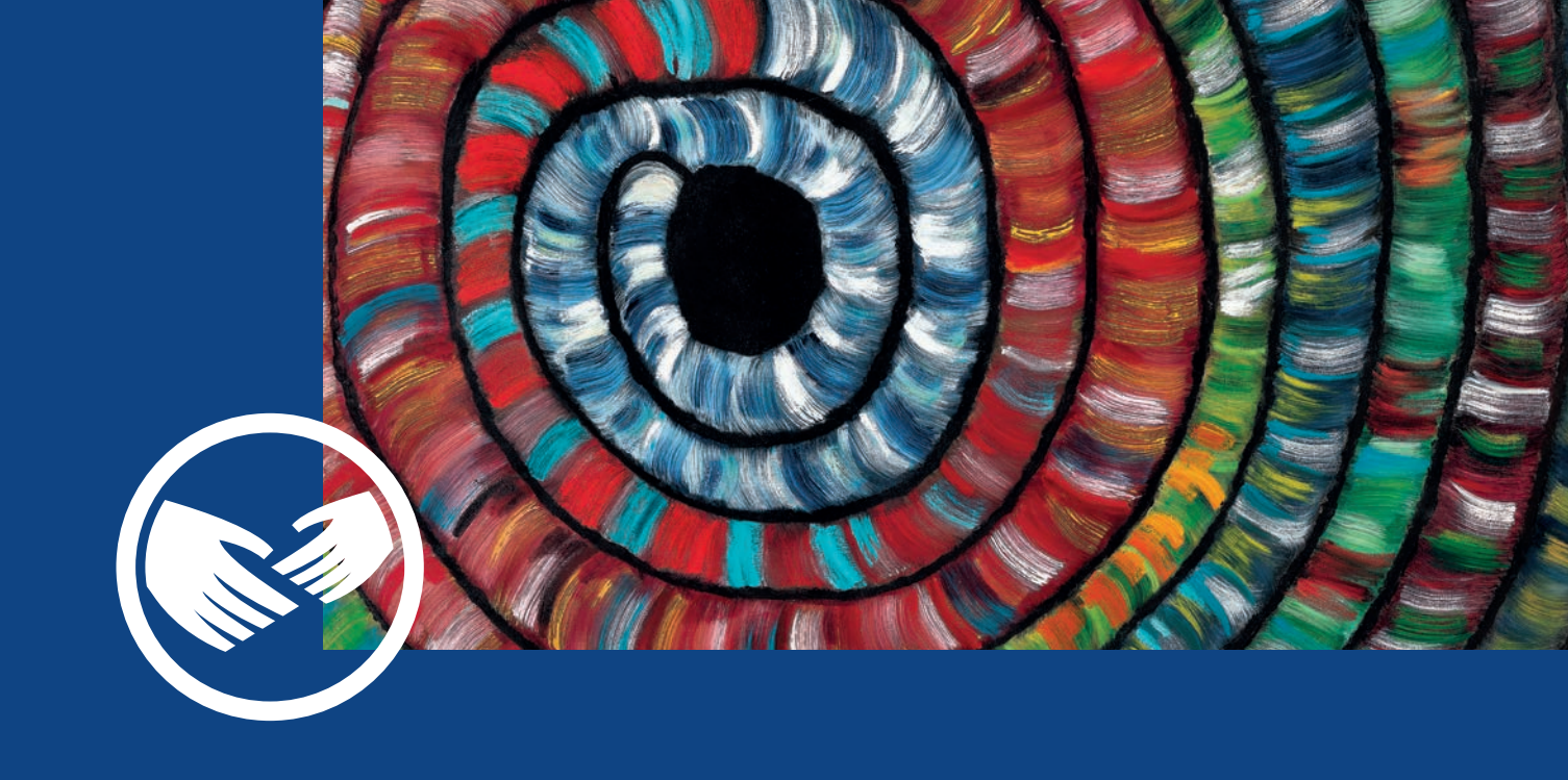
Action: Build relationships through celebrating National Reconciliation Week (NRW).